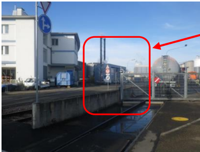
View to the railway lines of the harbor rail

Due to a near miss, the view on the railway lines was considerable increased: